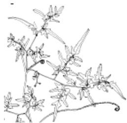
Japanese Climbing Fern